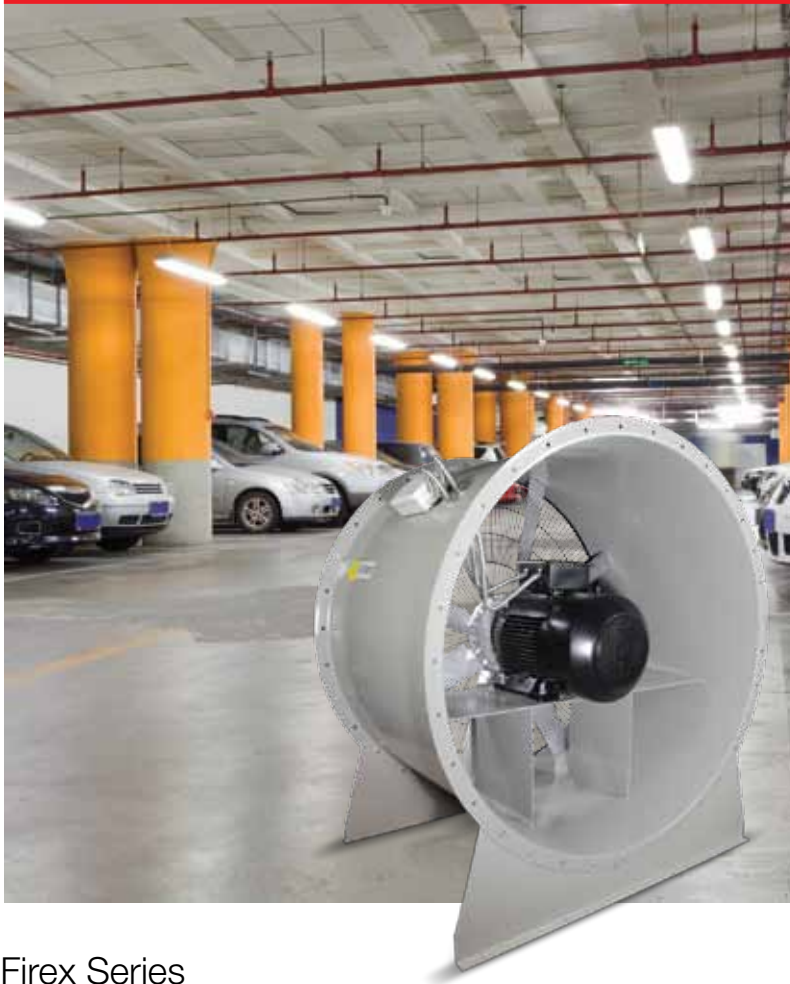
Firex Series Catalogue 2012