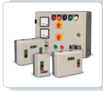
Submersible &amp; Motor Starter