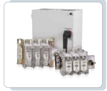
Switch Disconnecter Fuse