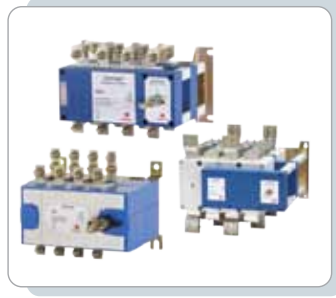
Euroload Change Over Switch