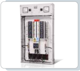
MCCB Panel Board