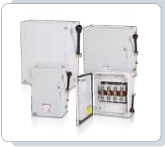
Load Changeover Switch